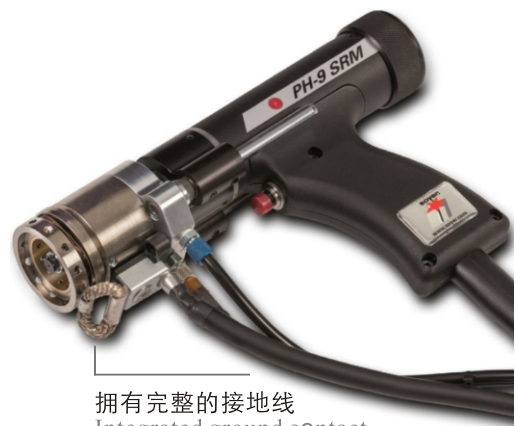
拥有完整的地线 Integrated ground contact

技术规格如有变更，恕不另行通知。 | 请关注www.soyer.com.cn，获取更多信息。