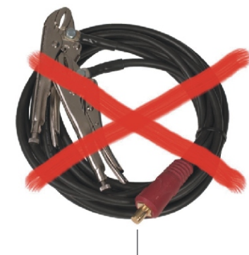
不需要额外连接地线 No extra ground cable needed!