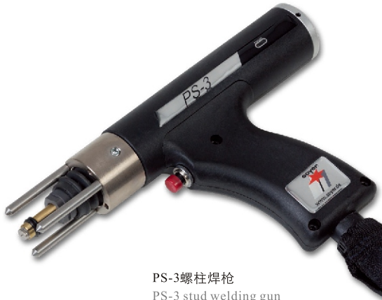
PS-3螺柱焊枪 PS-3 stud welding gun