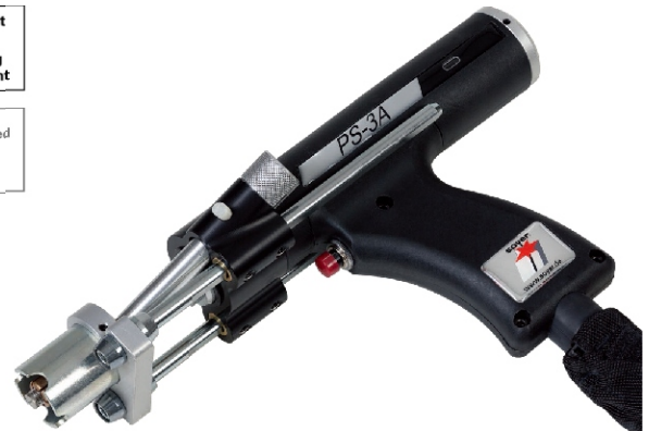
PS-3A自动焊枪 PS-3A automatic welding gun