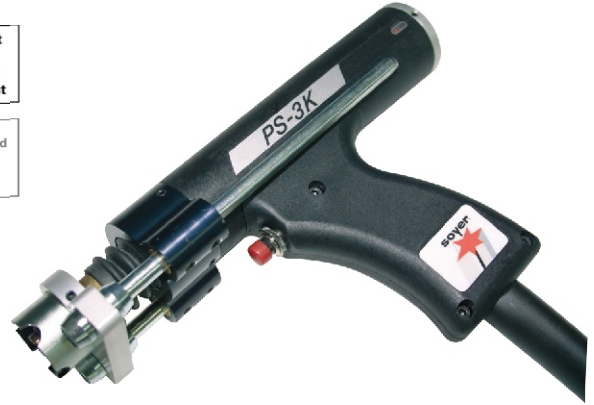
带支撑的PS-3K螺柱焊枪 PS-3K stud welding gun with support